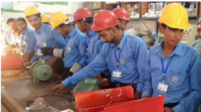
General Electrician Trade - VTI Mianwali