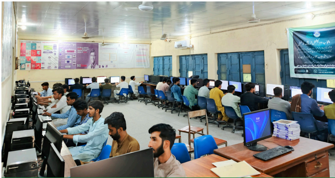
Computer Operator Trade - VTI Mianwali

has been playing a transformative role by establishing vocational training institutes across Mianwali to provide youth with industry-relevant skills.