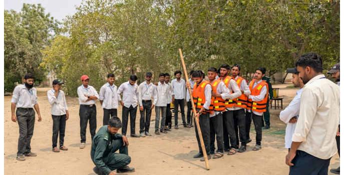
RESCUE 1122 Session at Mianwali

Nearly 40–45% of the population falls within this productive age bracket of 15 to 40 years, translating to over 700,000 individuals, with a fairly balanced gender distribution. Economically, Mianwali is a blend of agriculture, mining, and emerging industries. The district is well known for the