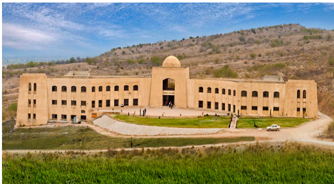
Namal University, Mianwali

The district is connected to major cities like Rawalpindi, Sargodha, and Dera Ismail Khan, making it a vital transit point. Its landscape is diverse, ranging from fertile plains near the Indus River to the rugged Salt Range, offering opportunities for agriculture, mining, and energy development.