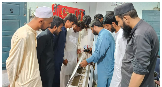
HVACR-Level II Trade - VTI Mianwali

This economic profile underscores the importance of skill-based training to prepare the youth for jobs in energy, construction, agriculture technology, IT, and services sectors. Without vocational support, the district’s youth risk being underemployed or forced into low-paying, informal jobs. Given the youth population, literacy gap, and economic potential, vocational training is not just desirable but essential for Mianwali. Skill development in renewable energy, construction, mechanical trades, ICT, and services can create pathways to sustainable employment, poverty reduction, and women’s empowerment. Linking informal skills with formal certification, particularly for women